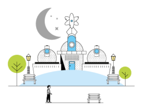
Science, technology and innovation